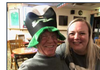
St Patrick's Day!