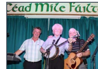
Dublin City Ramblers