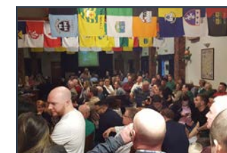
Ireland Rugby Match