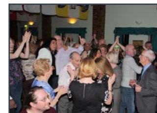
Craicheads band night