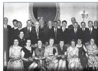
An old committee image