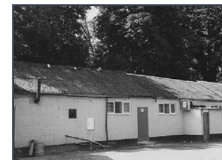
The original 'Hoot'