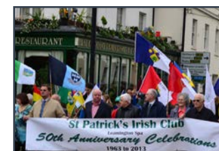
50th Parade Day